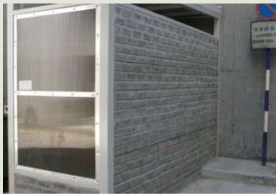
垃圾站外牆採用環保再造磚興建 The RCP's main wall is made of Eco-Glass Blocks

物料回收承辦商每天兩次往垃圾站收集廢物，該垃圾站由物業管理處的庶務及樓宇管理組管理。