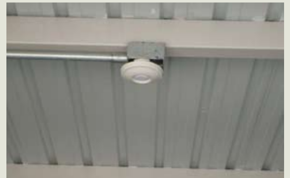
垃圾站安裝的太陽能照明感應器 Solar lighting occupancy sensor installed in RCP

The new RCP was built partially with environmentally friendly ECO-Glass Blocks into which an air cleaning