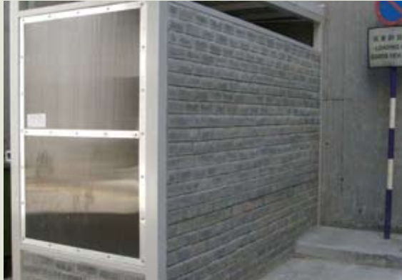
垃圾站外牆採用環保再造磚興建 The RCP's main wall is made of Eco-Glass Blocks

物料回收承辦商每天兩次往垃圾站收集廢物,該垃圾 站由物業管理處的庶務及樓宇管理組管理。