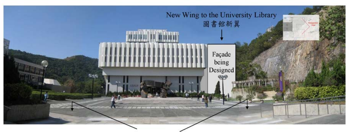
Underground Annex 地下層

Attachment 3: View of University Square at Later Stages of Construction