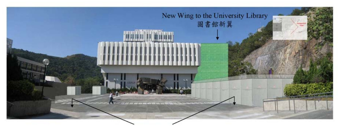
Underground Annex 地下層