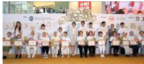
Launch of the new Cadenza TV-series 12 July 2009