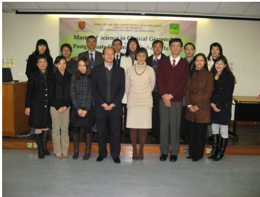
Group photo of the Best Projects Presentation Ceremony held on 20 November 2009