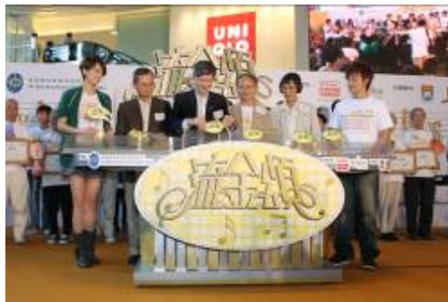
Launch of the new Cadenza TV-series 12 July 2009

The series was developed alongside the six themes of CADENZA: (1) Health Promotion & Maintenance: Optimising Mental and Physical Functions; (2) Health & Social Services in Hong Kong; (3) The Living Environment; (4) Quality of Life & Quality of Dying; (5) Legal & Financial Issues; and (6) Ageism / Disparity.