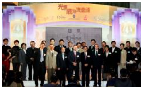
Cadenza 18-district programme 1 December 2008

The objectives of the programme are: (1) to revolutionise the ways people view and care for the elderly; (2) to equip the soon-to-be-old with knowledge contributing to active and positive ageing; and (3) to highlight topics pertaining to positive ageing to residents of Hong Kong's 18 districts, having regard to specific local characteristics.