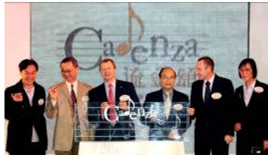
Cadenza 18 district programme 1 December 2008

November 2009 Activity – Managing Health Risks and Chronic Conditions October 2009 Activity – Government Medical Services September 2009 Activity – Community Service: Old Age Homes and Later-life Living Arrangement August 2009 Activity – Healthy Hearing July 2009 Activity – Living in a Safe Environment June 2009 Activity – Home Adaptation May 2009 Activity – Oral Health April 2009 Activity – Healthy Lifestyle and Eating Happily March 2009 Activity – Eye Protection February 2009 Activity – The Exercise Pattern for Older Persons January 2009 Activity - Winning the Second Half of Life