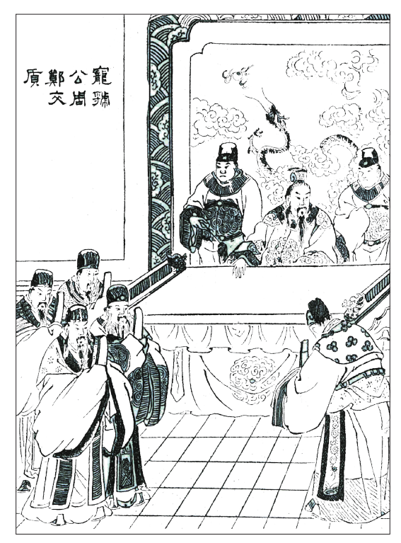
The Duke of Guo is Favoured, Zhou and Zheng Exchange Hostages \,