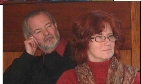
Staff and Students at a Prd Study Day in Cambridge