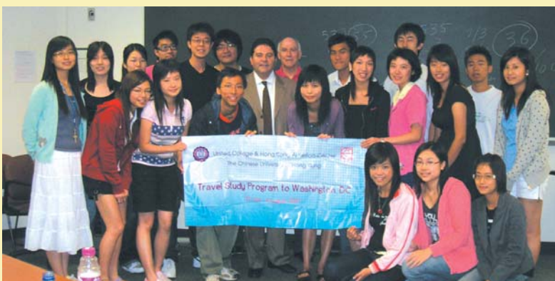
聯合同學透過講座了解美國的司法制度。

UC students visiting local families in US.