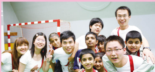
聯合書院及清華大學的學生為香港少數族裔小朋友安排了一天的中大參觀活動，並與他們於張煊昌體育館玩集體遊戲。