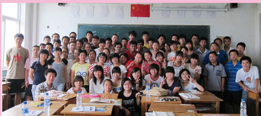
Students from United College and Tsinghua University posed a photo with the students in the rural area of Hebei in a classroom.