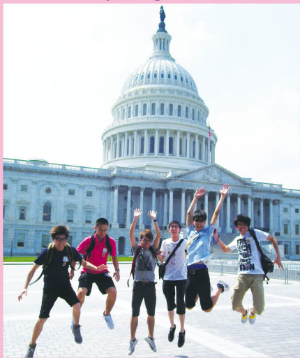
同學於美國首都華盛頓的國會大廈前跳躍。 Students leaped into the air before the United States Capitol in Washington, DC.