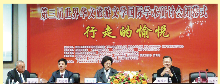
研討會閉幕禮於 12 月 11 日假廣州華南理工大學舉行。