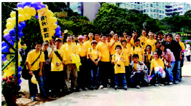
▲行畢全程的聯合書院隊。 United College Team at the finish point.