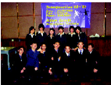
湯若望宿舍 湯家村 Adam Schall Residence