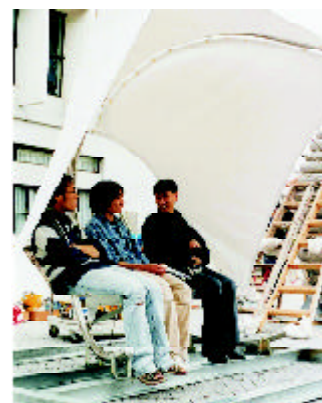
▲One of the commanded pavilions "The Butterfly". 其中一個獲獎作品 The Butterfly。