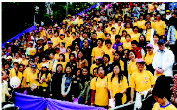
聯合書院隊穿上黃色棉衣，份外精神奕奕。 High spirited United College team members in yellow T-shirt uniform.