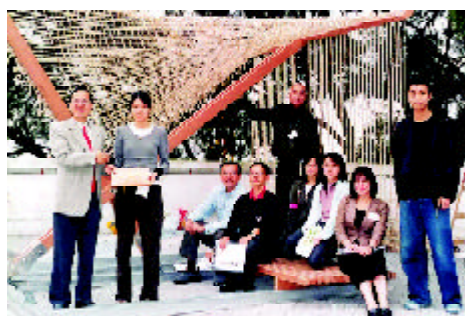
▲The judging panel with the designing team of "The Raw Pavilion". 評判團與得獎同學合照，作品名為 The Raw Pavilion。