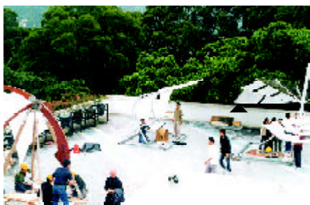
▲Participants busily transferring their ideas into products. 各組同正忙碌地裝設涼亭。