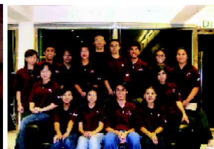
伯利衡宿舍 宿伯卿弟 Bethlehem Hall