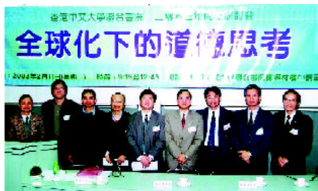
▲眾嘉賓於周年研討會後合照。 A group photo of guests after the workshop.