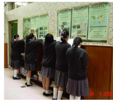
濕地保育 Conservation of wetlands

此外，參與推動「健康學校」的工作著實使我們獲益良多。我們對健康問題的警覺及知識都增加了；而校內亦加強了各科組的溝通，使校內有和諧的合作氣氛；最後，透過與家長緊密合作，更能達到家校一心，共同培育健康愉快的下一代。凡此種種，皆為學校往後的發展奠下良好的基石。