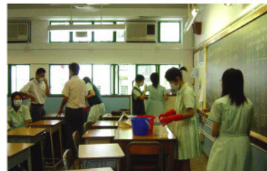
清潔課室 Classroom cleaning