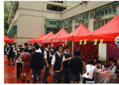
健康嘉年華 Health carnival

Last but not least, we have gained much from implementing the Scheme. We are now more alert to health and become more knowledgeable in this aspect. Effective communication is achieved among various units in school and a harmonious working environment is created. Concerted efforts have been made with parents which help our students to grow up happily and healthily. All these valuable experiences have helped us to lay a solid foundation for the development of our school in the future.