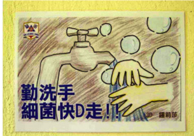
海報設計比賽得獎作品 Poster design competition

「嘩！六大範疇！」要落實施行真不容易，不單要取得全校教職員的認同，由老師以身作則，樹立榜樣，更要由專責小組制定各項策略讓全校師生參與。此外，家長的參與也同樣重要，因為家庭管教方法對子女的行為表現有重大的影響，絕對不容忽視。