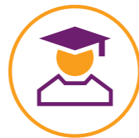
Student union fees