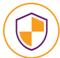
Health and travel insurance