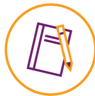
Books and stationery