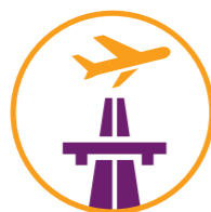
Airfare and transportation