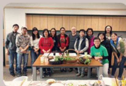
Lunch gatherings to taste food produced from Lingnan Garden or home-made by members