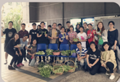
Students work on natural healthy soil and grow over 100 varieties of plants