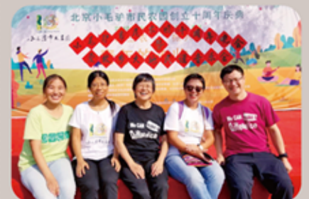
The team paid visits to a partner: Little Donkey Farm in Beijing

Liberal Arts Education . Transformation For Life