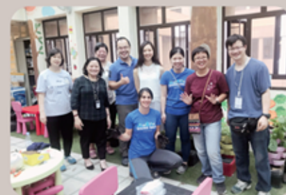
The team helped improve the Mini Garden of Tuen Mun Hospital